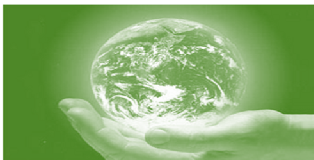
Fig: 2.3: sustainable development

Developing countries such as India and China did not have to commit to reductions during the period 2008-2012 because their per capita emissions were much lower than those of developed countries and because their economies could not easily cope with the cost of switching to cleaner fuels. However, developing countries will be expected to play more active roles in the fight against global warming in the future as these countries become more industrialized and new, more affordable and efficient energy technologies are created.