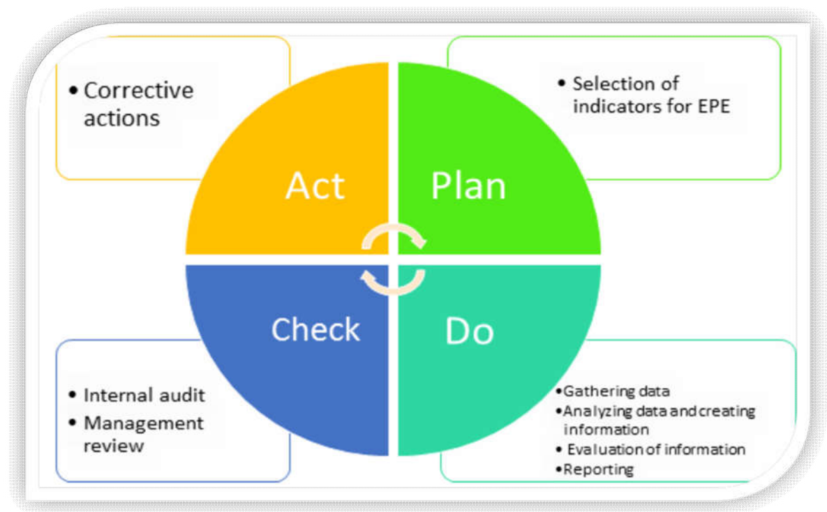
Fig. 9.1: application of PDCA cycle in an EPE

As with the EMS itself, a Plan-Do-Check-Act cycle is useful when conducting and developing an EPE.