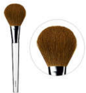
Face powder brush