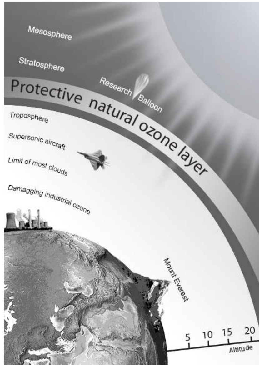
Fig: 1.1: the ozone layer

Earth's atmosphere is divided into three regions: the troposphere , the stratosphere , and the mesosphere . The stratosphere extends up to 10 to 50 kilometres above Earth's surface. This region contains a pungent, bluish gas concentrated in what is known as the ozone layer . Ozone gas is made up of molecules which are each made up of three atoms of oxygen. Thus, its chemical formula is O 3 . The ozone layer acts as a filter which blocks out harmful solar ultraviolet B, or UVB, rays.