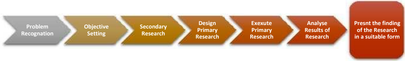
Fig 1.2: The MarketResearchProcess

Usually, it is recommended to begin Market Research using secondary sources. It proves to be beneficial in a number of ways. The costs are cheaper and it is much quicker. Sometimes, you might even find the exact information that you needed, so no research of your own is required. And even if you find incomplete information, you will only have to fill in the gaps with primary research of your own; which is indeed much easier, time saving and cheaper than conducting the entire researches yourself.