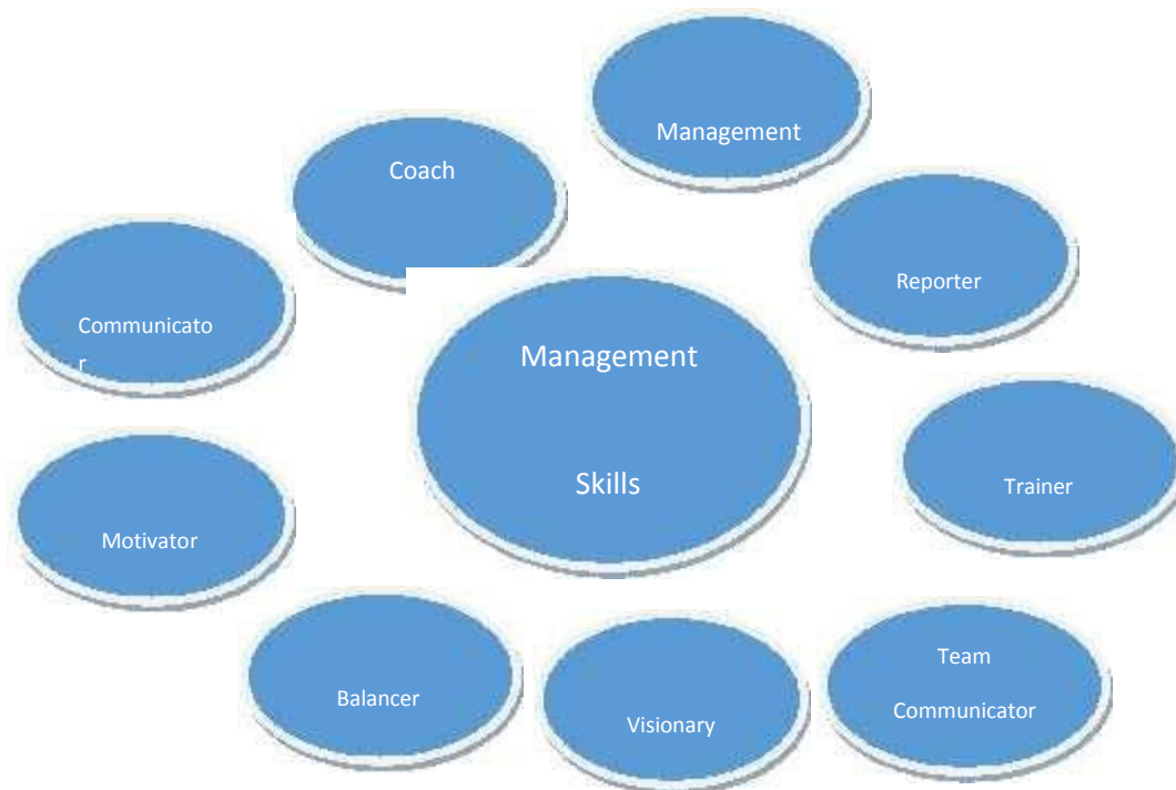
Fig : 3.2 Management Skills