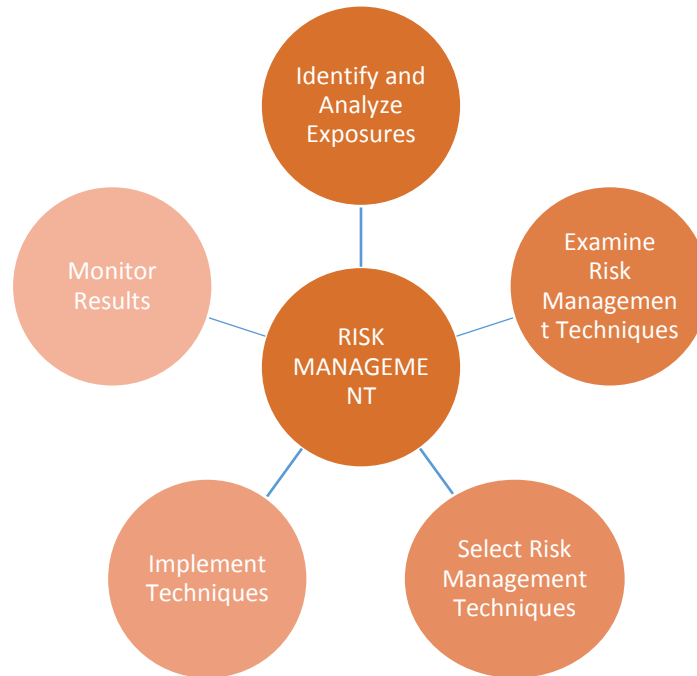
Fig : 10.1

Generally people think that simply buying insurance is managing their risk. However, insurance is not the only method of dealing with risk. Other, often cheaper options are available for different circumstances.