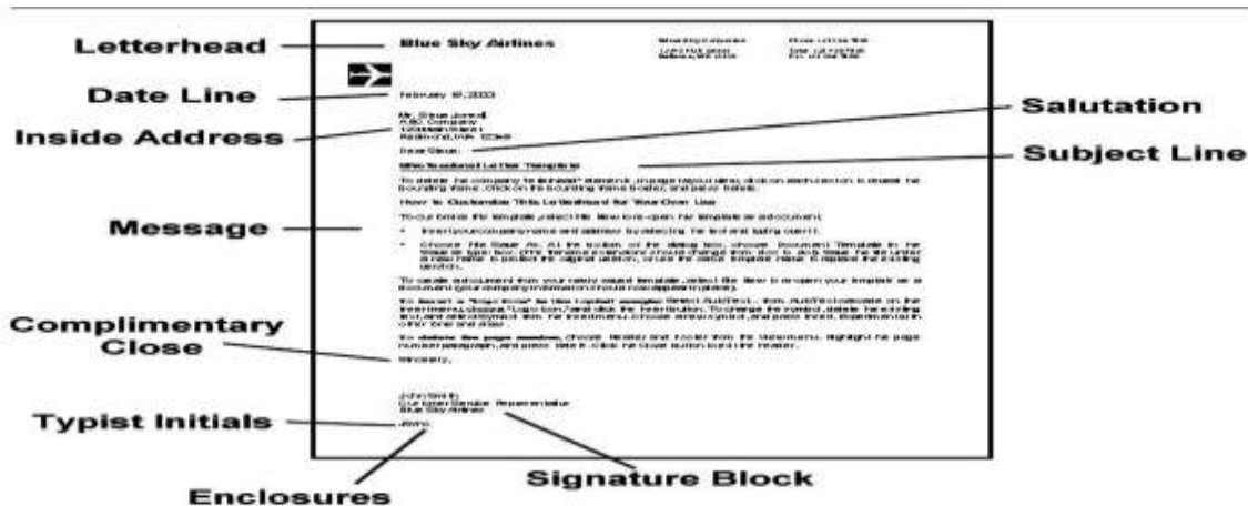
FIGURE 8.1 Parts of a Business Letter