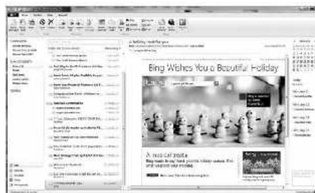
FIGURE 8-15 Windows Live Mail

IBM's LotusLive Suite is an email messaging and collaboration program that includes email, a schedule, a To-Do list, a calendar, an address book, a personal journal, Web pages, and databases. LotusLive Suite can be integrated with voice mail, pagers, fax, and wireless devices such as cellular telephones and smart phones. Figure 8-16 shows a screen image of LotusLive Suite.