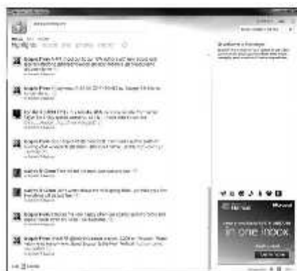
FIGURE 8-18 Windows Live Messenger.

information that appears at the top of the message. Verify that you sent the message to the proper address. If the problem persists, notify your ISP or the person you're trying to send mail to.