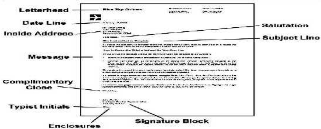
FIGURE 8-1 Parts of a Business Letter