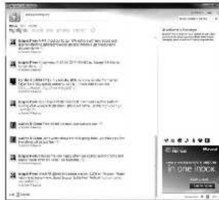
FIGURE 8-18 Windows Live Messenger.

information that appears at the top of the message. Verify that you sent the message to the proper address. If the problem persists, notify your ISP or the person you're trying to send mail to.