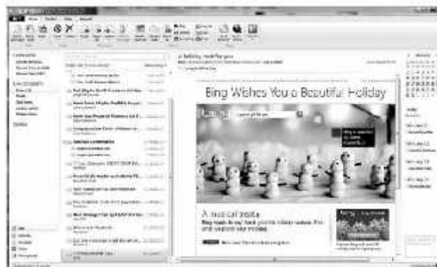
FIGURE 8-15 Windows Live Mail

IBM's LotusLive Suite is an email messaging and collaboration program that includes email, a schedule, a To-Do list, a calendar, an address book, a personal journal, Web pages, and databases. LotusLive Suite can be integrated with voice mail, pagers, fax, and wireless devices such as cellular telephones and smart phones. Figure 8-16 shows a screen image of LotusLive Suite.