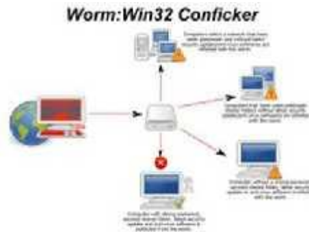
Fig. 2.1 Spread of Conficker worm

These definitions lead to the observation that a virus requires user intervention to spread, whereas a worm spreads itself automatically. Using this distinction, infections transmitted by email or Microsoft Word documents, which rely on the recipient opening a file or email to infect the system, would be classified as viruses rather than worms.