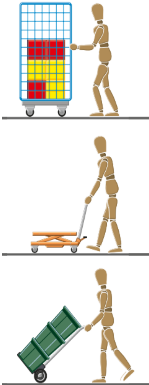
Figure 2 Acceptable push/pull postures