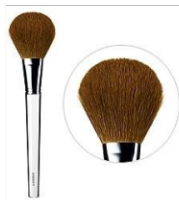
Face powder brush