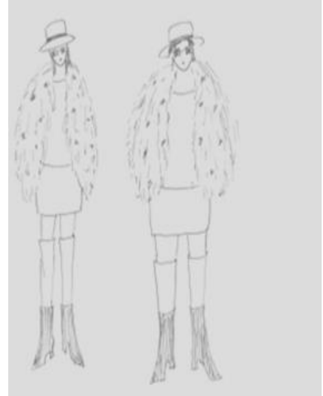
EFFECT OF STIFF & BULKY FABRICS ON THINNER & LARGER PEOPLE