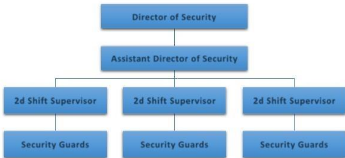
Fig: 3.4 Organisation chart for a security department