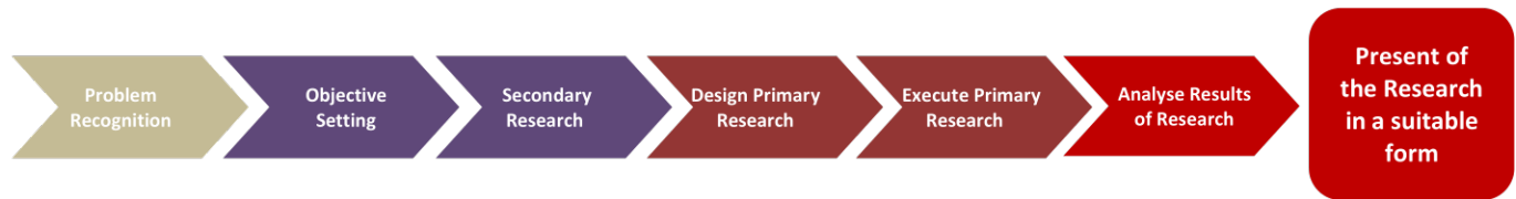
Fig 5.2: The Market Research Process

Usually, it is recommended to begin Market Research using secondary sources. It proves to be beneficial in a number of ways. The costs are cheaper and it is much quicker. Sometimes, you might even find the exact information that you needed, so no research of your own is required. And even if you find incomplete information, you will only have to fill in the gaps with primary research of your own; which is indeed much easier, time saving and cheaper than conducting the entire researches yourself.